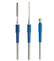
ES01, ES02, ES20