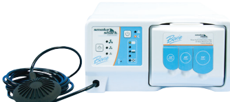
SE02 Smoke Evacuator †