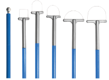
Disposable LLETZ/LEEP Loop and Ball Electrodes †