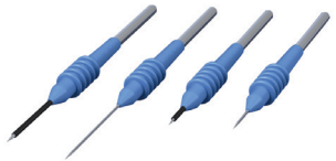
Disposable SuperCut™ Needles Electrodes †