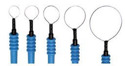
Disposable Dermal Loops †